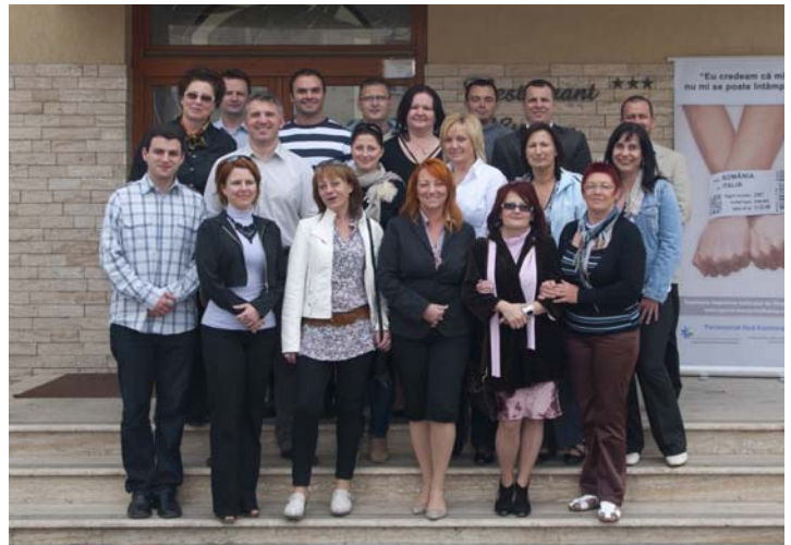
The project team against human trafficking

The cross-border project “Together against human trafficking” (HUSKROUA/0901/028) is based on the partnership between NGOs from 3 countries. Project activities are implemented by the League for Defence of Human Rights-branch of Satu Mare (Romania), in partnership with the Helper Hand 2003 - Social Association (Hungary) and the Malteser Charity Organisation of Berehovo (Ukraine).